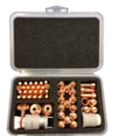
Wear part box for LC65