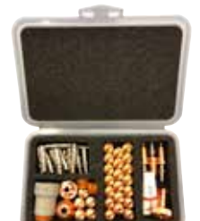
Wear part box for LC105